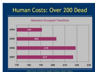
Human, Injury & Economic Costs