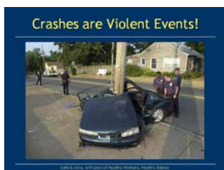
Basic Physics of Vehicle Crashes